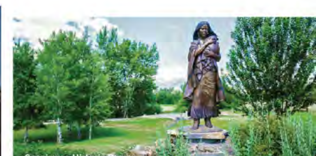
Sacajawea Historic Byway