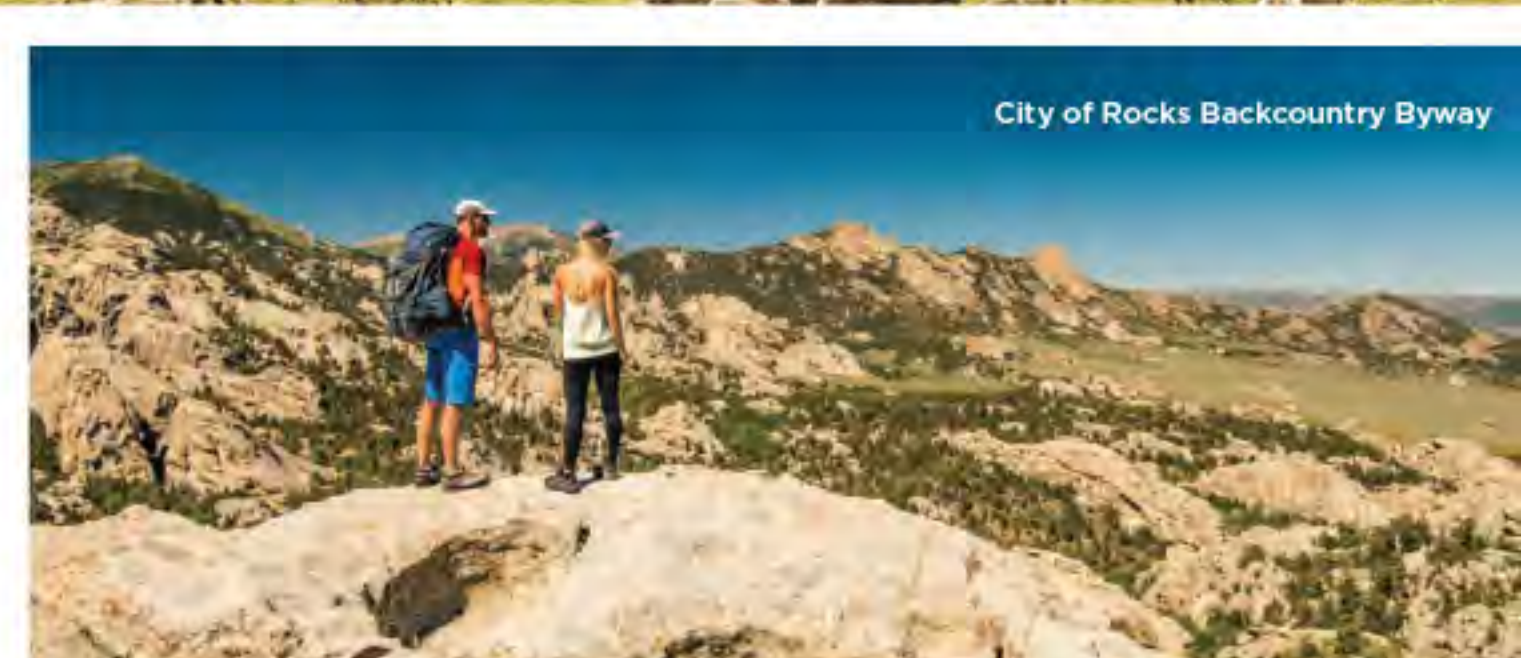
City of Rocks Backcountry Byway