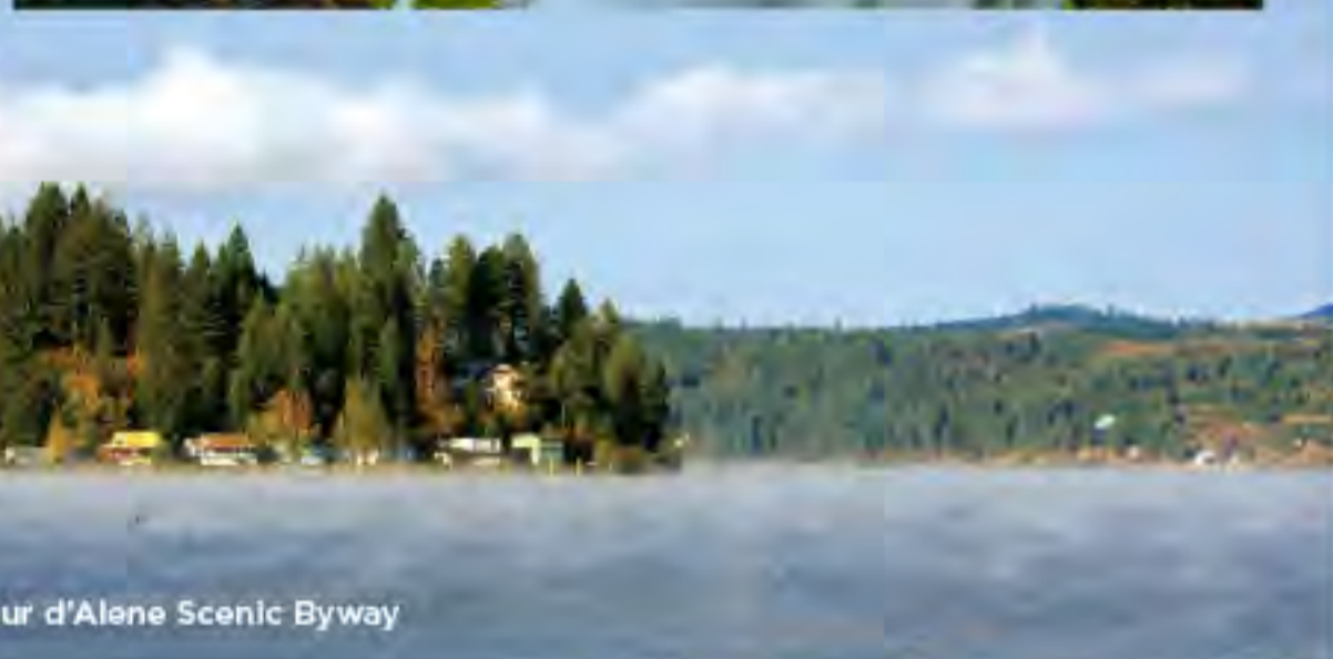
Lake Coeur d'Alene Scenic Byway