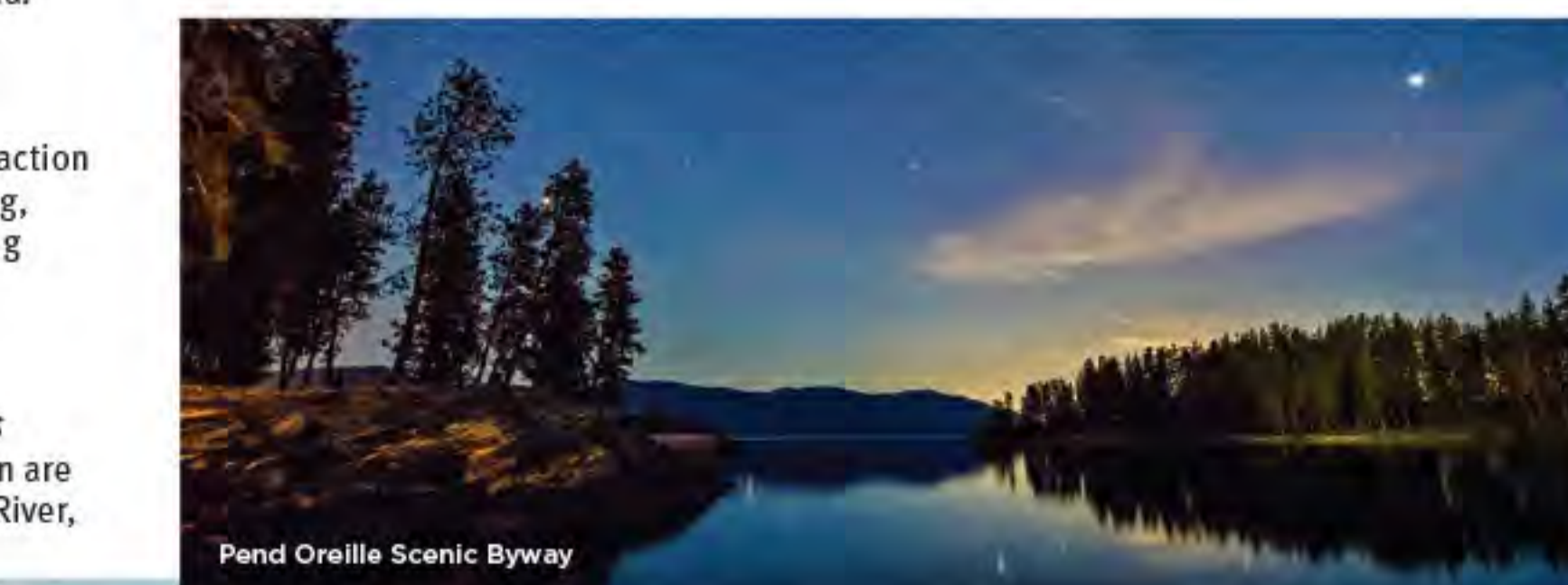
Pend Oreille Scenic Byway