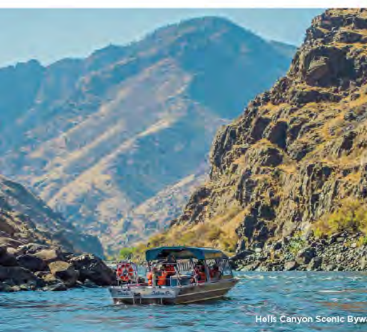
Hells Canyon Scenic Byway