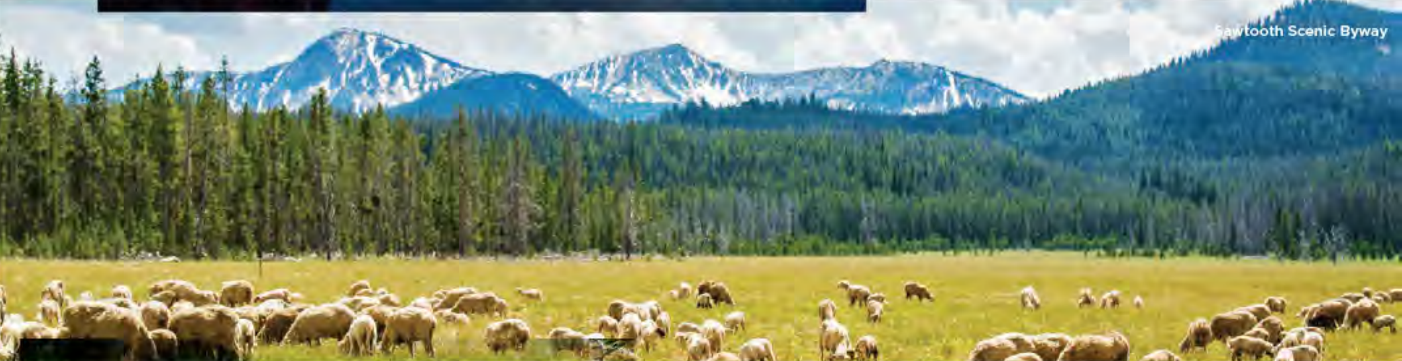
Sawtooth Scenic Byway