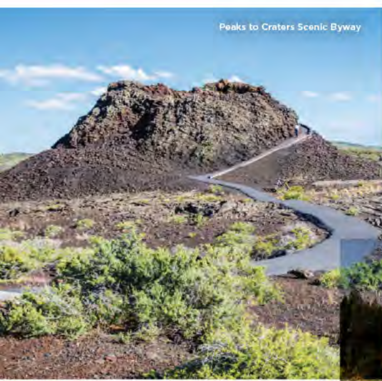
Peaks to Craters Scenic Byway

SAWTOOTH SCENIC BYWAY 115.7 MILES Climb 115 miles up Highway 75 into the heart of central Idaho, from the high desert to the Sawtooth Mountains at Stanley. Highlights include Sun Valley (North America's first ski resort), Galena Summit, and Redfish Lake. 208 774-3411