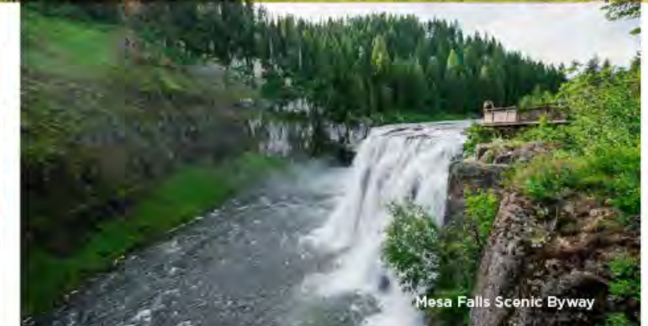
Mesa Falls Scenic Byway