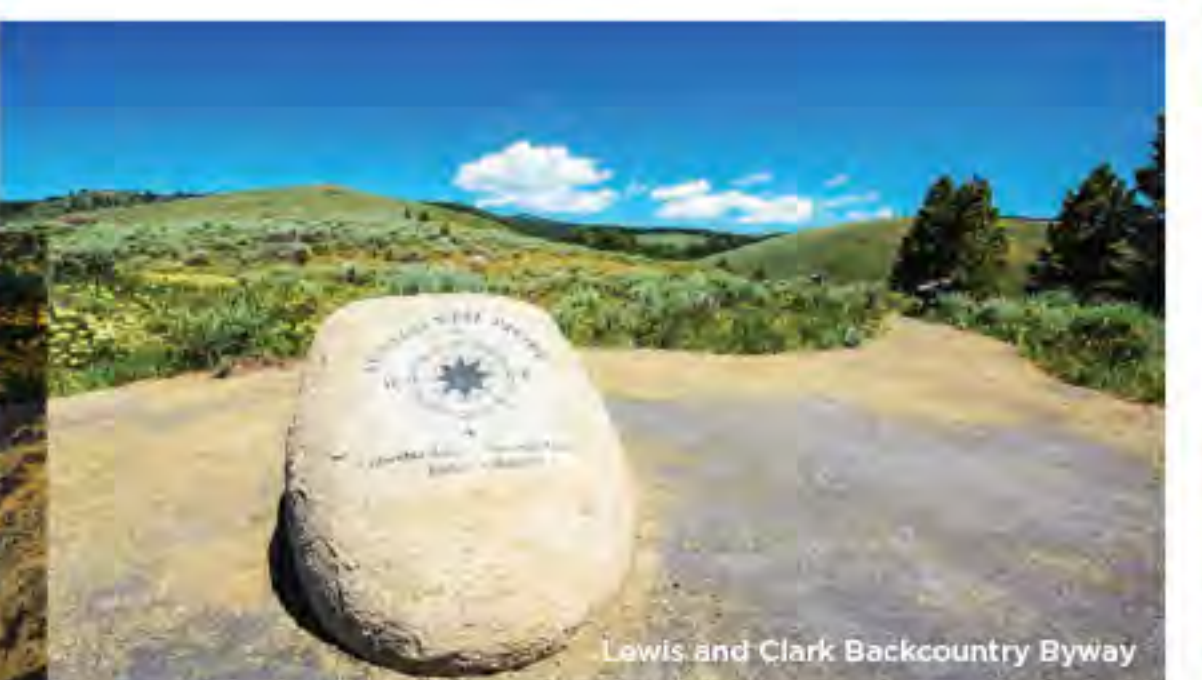
Lewis and Clark Backcountry Byway