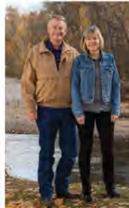
Governor Brad Little and First Lady Teresa Little