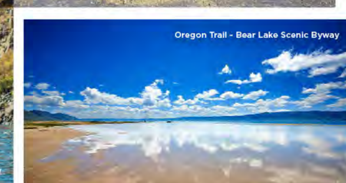
Oregon Trail - Bear Lake Scenic Byway